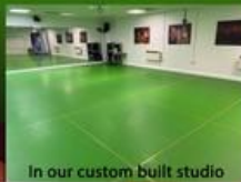
In our custom built studio